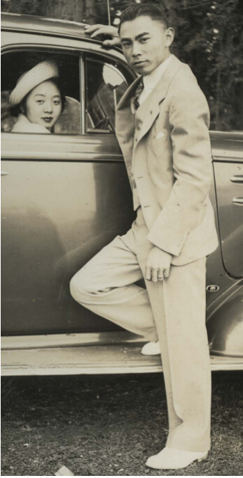
Frank Kubo Collection (ddr-densho-128-141)

The Densho Digital Repository (DDR) contains almost 1,000 oral histories and over 100,000 historical photographs, letters, newspapers, documents, and ephemera. Here you will find helpful tips for discovering the rich content available to you at ddr.densho.org .