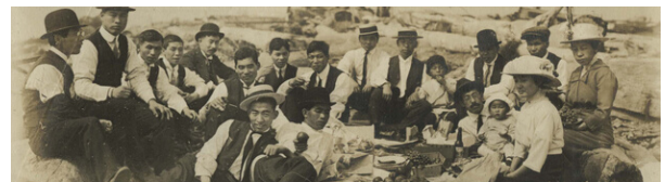
Tamura Collection (ddr-densho-124-21)

Facilities = incarceration camps and other detention facilities used during World War II